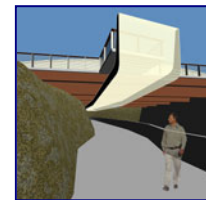
Artists' concept, including Translucent Barrier (left) and Luminous Canopy (right)